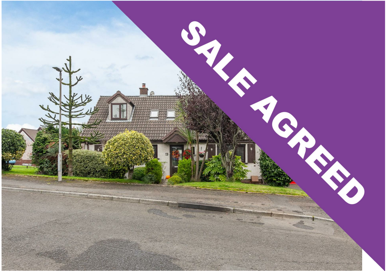
11 Sherwood Parks, Newtownabbey, BT36 5FY